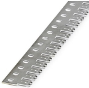
Potential busbar, with slotted 6.3/2.8 mm flat connectors, max. 40 A, brass, tin-plated, length: 1 m

Please be informed that the data shown in this PDF Document is generated from our Online Catalog. Please find the complete data in the user's documentation. Our General Terms of Use for Downloads are valid ( http://phoenixcontact.com/download )